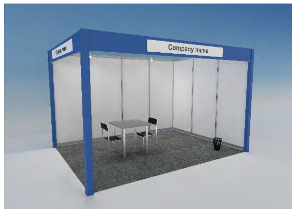
The sketches show a sample stand 12 sq.m. (linear and corner)