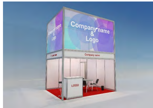
The sketches show a sample stand 12 sq.m. (linear and corner)