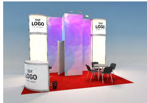
The sketches show a sample stand 12 sq.m. (peninsular and corner)